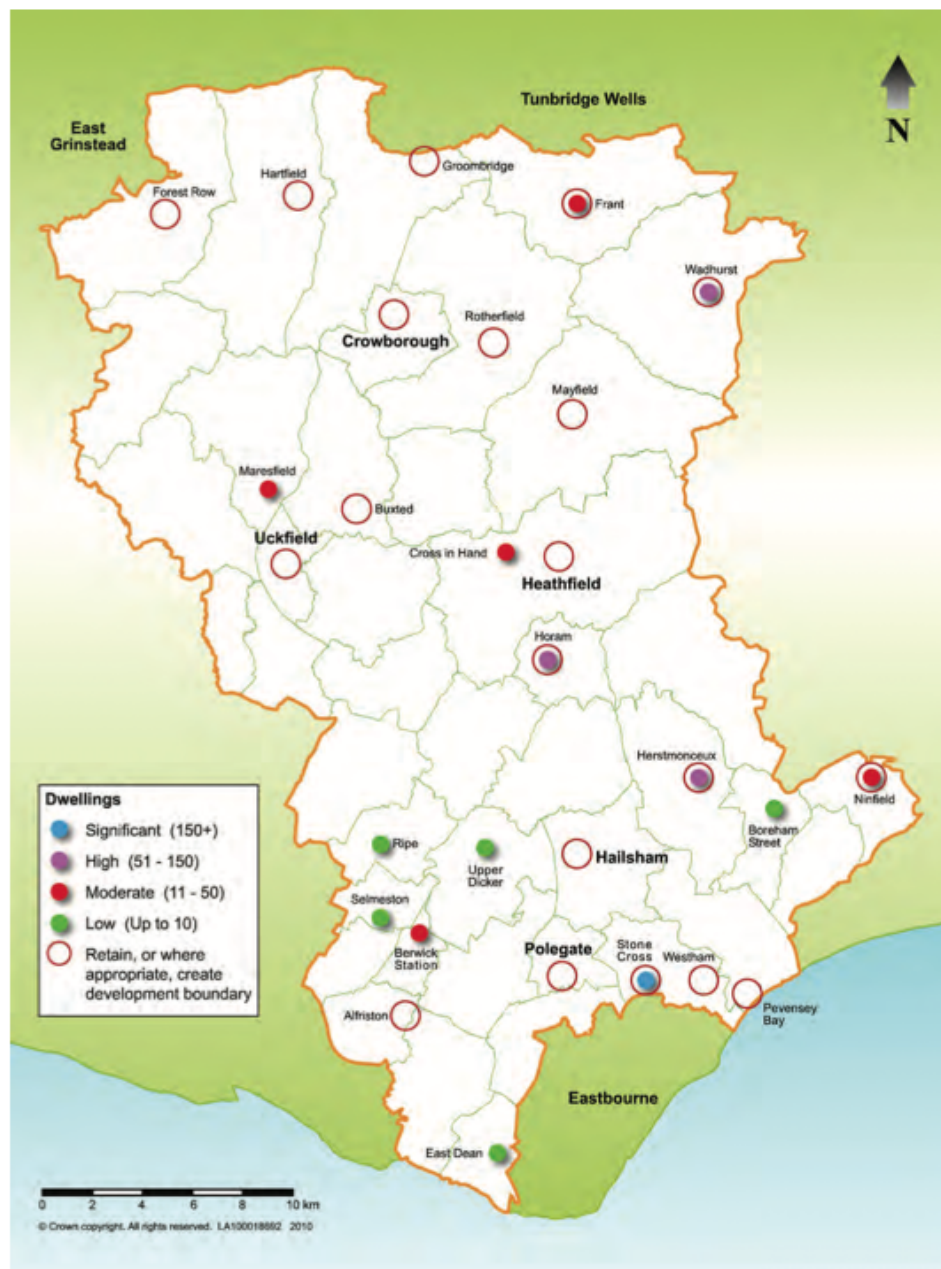
Figure 11 Growth potential of rural settlements and where development boundaries will be retained

Key to protecting the distinctive character of the built environment is to ensure that new development is in keeping.