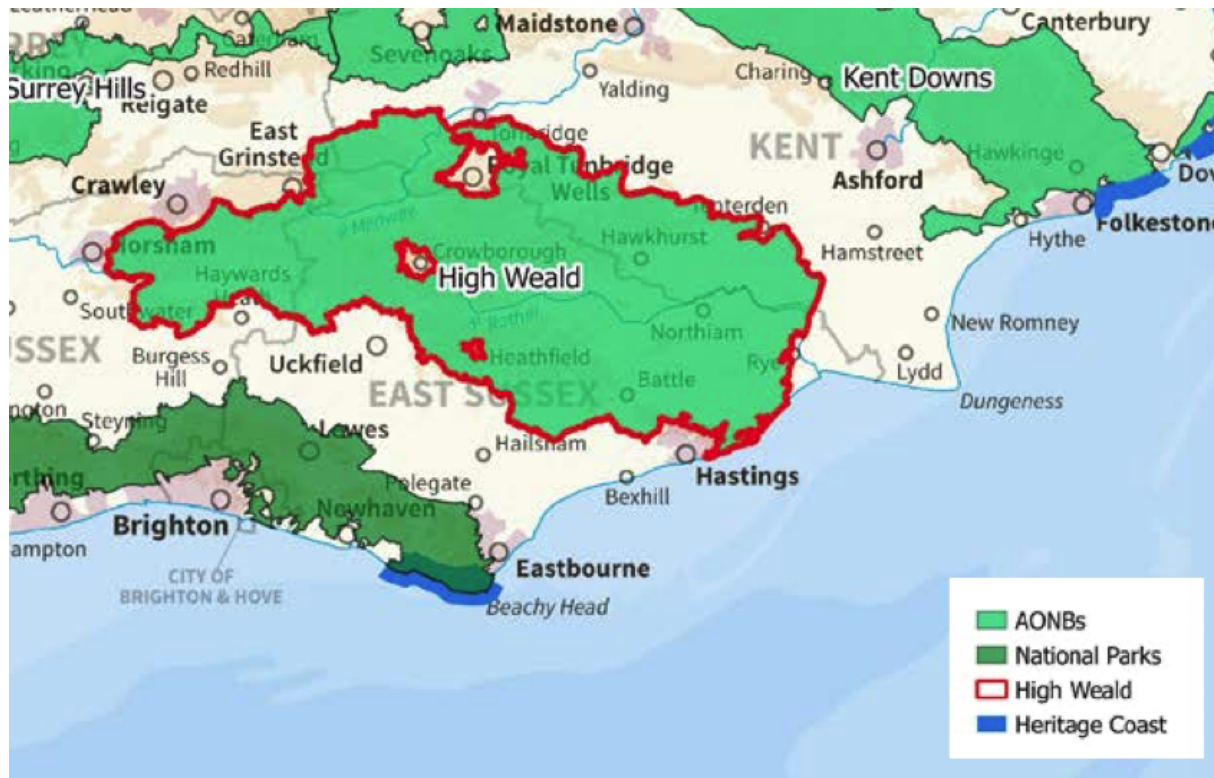
Figure 2: Boundary map of the High Weald AONB showing the exclusion of Heathfield, Crowborough and Tunbridge Wells

Wadhurst's AONB designation is predicated on the 'Natural Outstanding Beauty' of both its natural and built environment. Hence, it logically follows that to remain within the AONB Wadhurst's built environment must retain its distinctive character to remain "Outstandingly Beautiful".